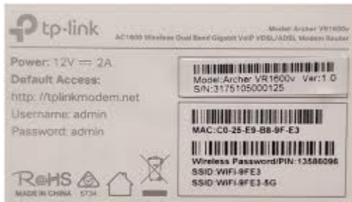
Example of wireless security card

Using the wireless security card from your modem, connect to the wireless (WiFi) network using the security code shown.